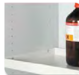
Painted steel shelf RIP60VMY11