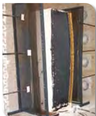
CHEMISAFE cabinet series FIRE MY11 AFTER fire resistance test.

So twice a year, BV checks the production and verifies the quality and the manufacturing process.