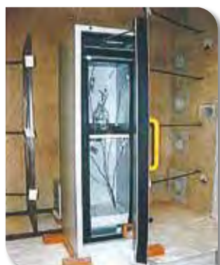
CHEMISAFE cabinet series FIRE MY11 BEFORE fire resistance test.

The tray volume must contain: at least 110 % of the volume of the largest container stored in the cabinet or 10 % of the total volume stored.